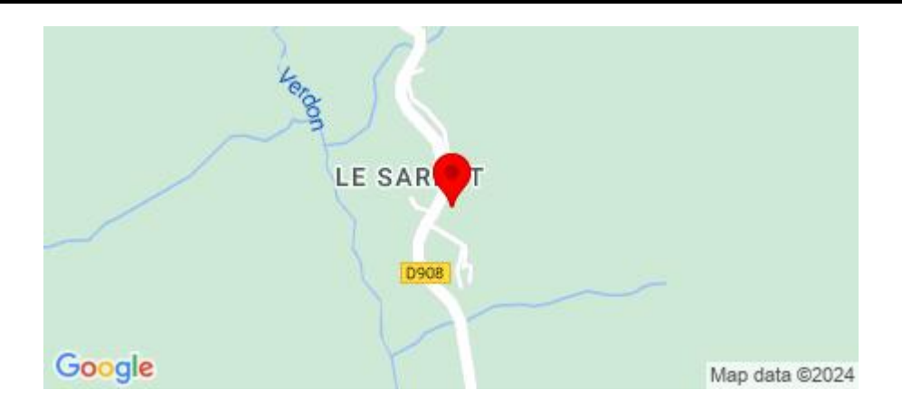
No Media available