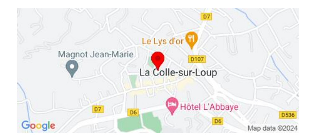
No Media available