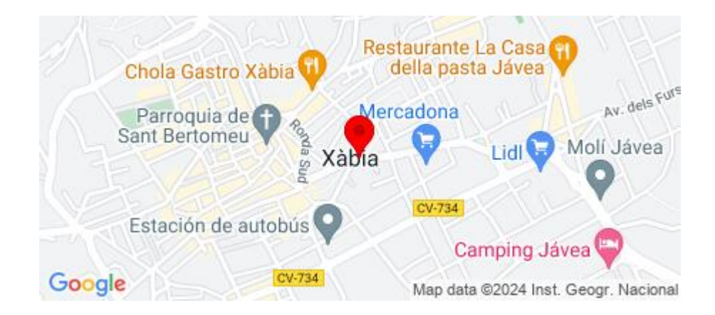
No Media available