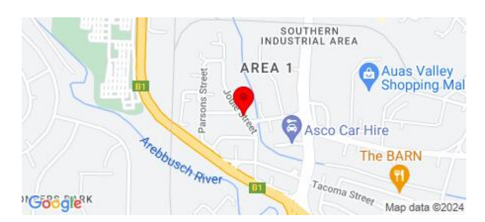
No Media available