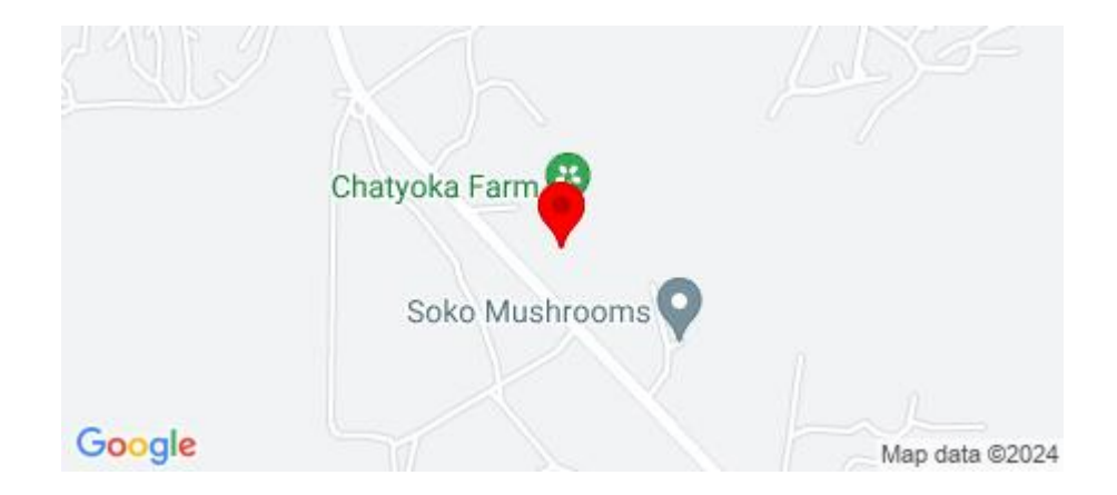
No Media available