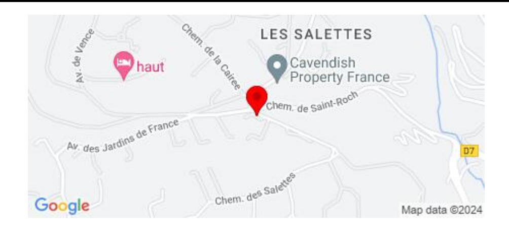
No Media available