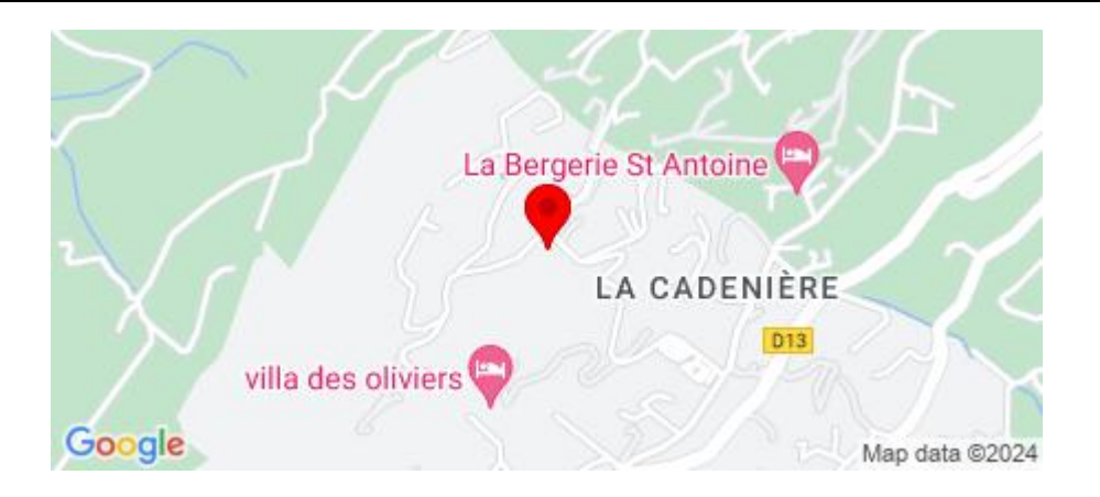
No Media available