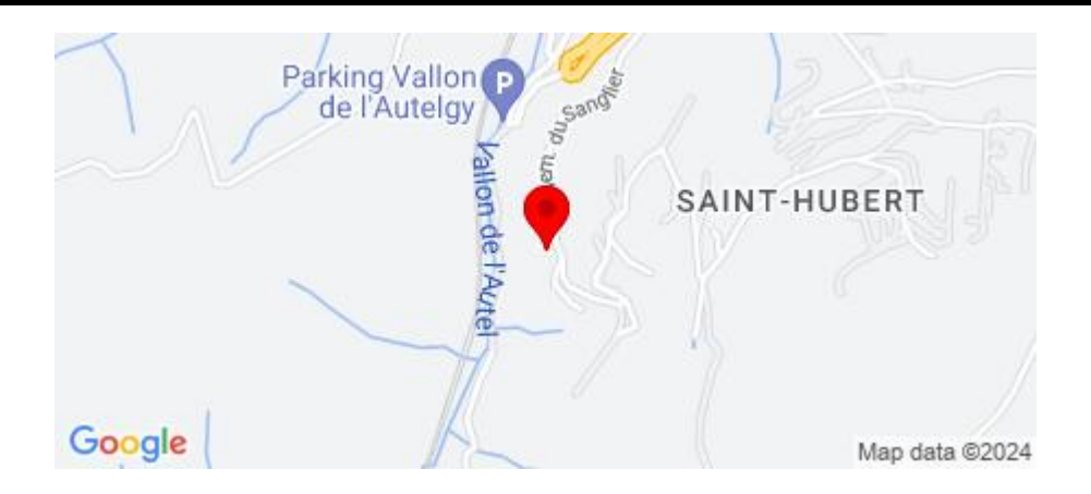
No Media available