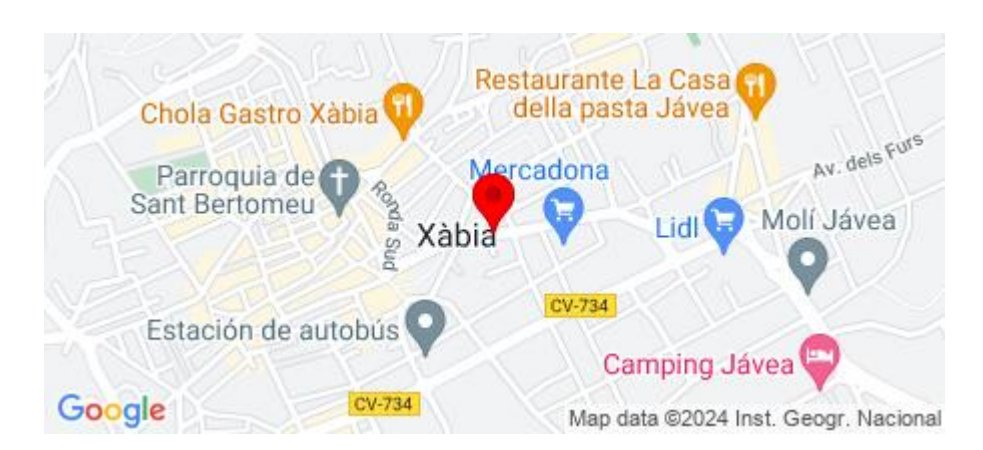
No Media available