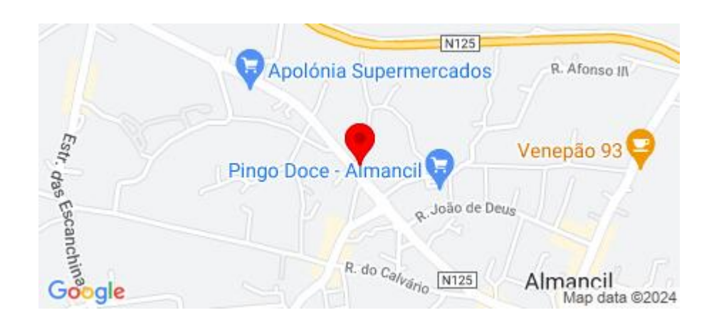
No Media available