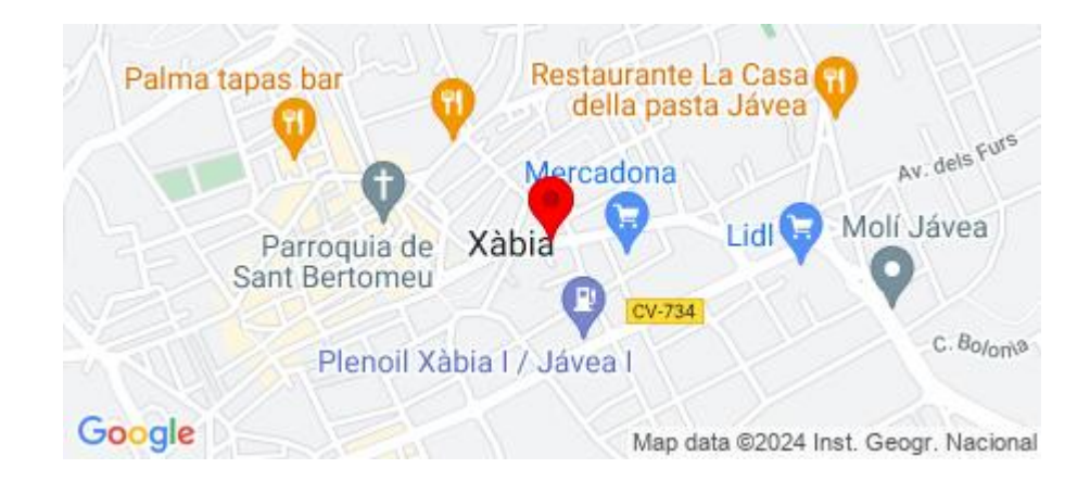
No Media available