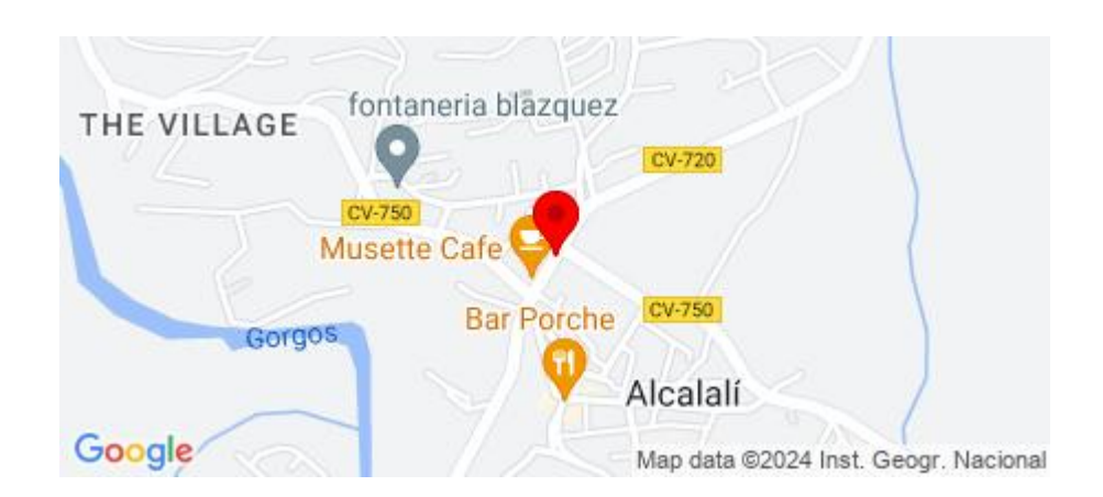
No Media available